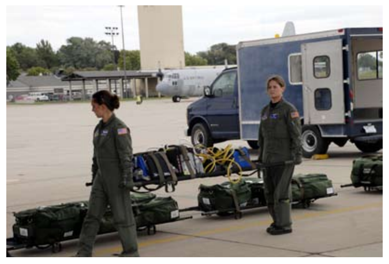
Members of the 934th Aeromedical Staging Squadron carry a litter aboard a C-130 aircraft before leaving on a hurricane relief mission.

During the week of Sept. 6, the 934th deployed operations and maintenance personnel to Southwest Asia and Aeromedical Evacuation Squadron members to Little Rock Air Force Base, Ark. to support hurricane Ike rescue efforts. The Aeromeds responded from six states within hours of notification and deployed 20 members who volunteered for the trip.