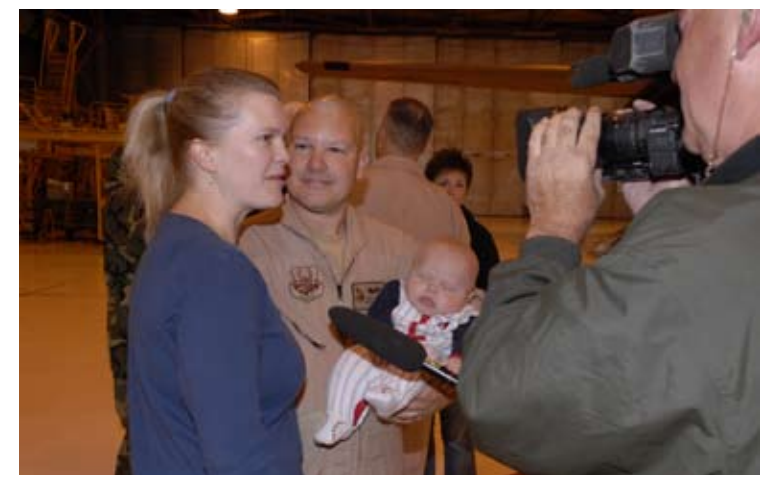
A 96th Airlift Squadron member and his family talk with reporters about the deployment.