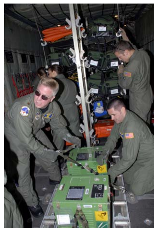
934th Aeromedical Evacuation Squadron members secure cargo and supplies aboard a C-130 before departing to support Hurricane Ike victims.