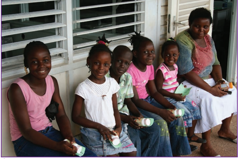
Suriname citizens await treatment by 934th members.