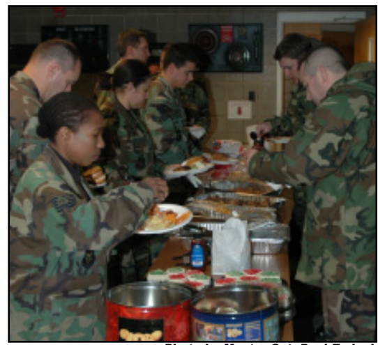
Members of the 934th celebrate the holidays with a catered feast