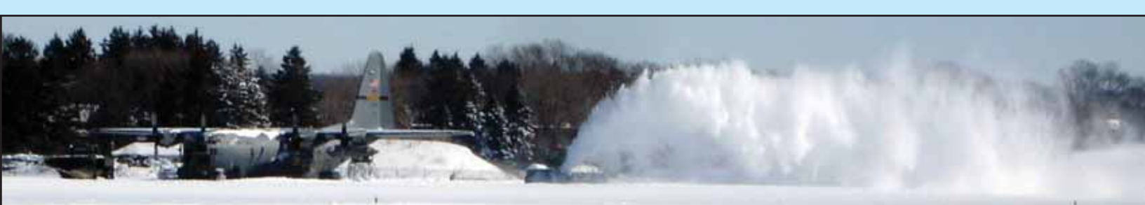
A C-130 demonstrates that it can add snowblower to its' long list of capabilities.

This experience shows the high degree of professionalism and expertise that lives in the 96 AS. We also want to take a moment to say thanks to our maintainers, aerial porters, and Services people who assisted in this effort. The extra effort on your part paid huge dividends that will continue to showcase this Wing as the leader in AFRC.