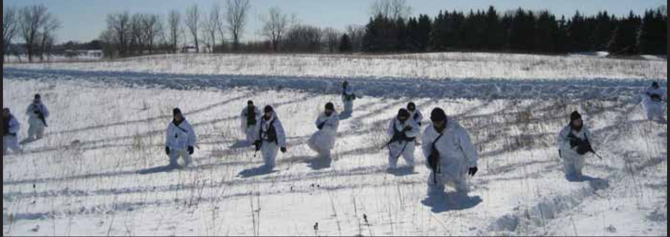
Two feet of snow gives SFS the challenge a Minnesota winter provides.