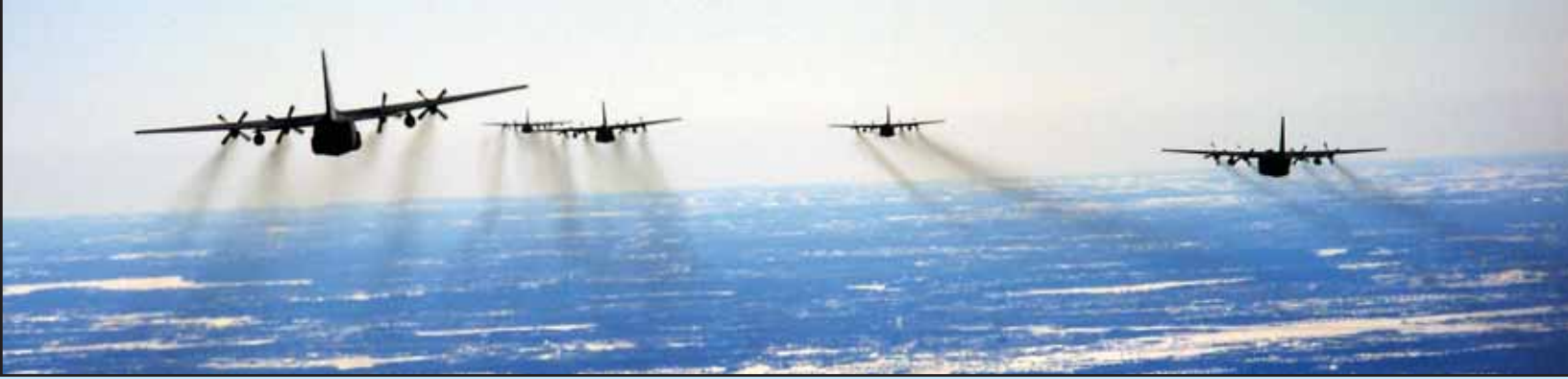
C-130s from four different units combined for a joint mission during the March UTA.