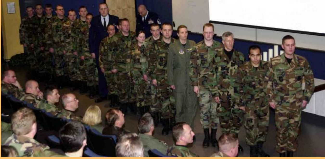
934th NCOs prepare for the Induction Ceremony.

It is said among chief's that "duty is in our blood; the safety of our nation is on our minds, and the American people are in our hearts. These are the reasons we serve."