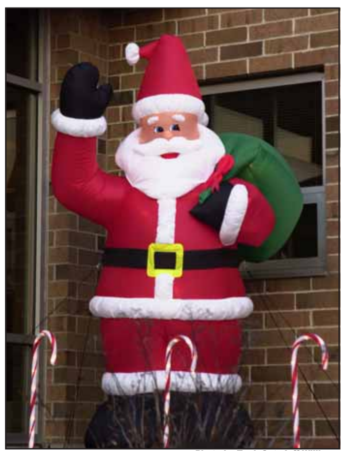
The man, the myth, the legend greets visitors to the 27th Aerial Port building.