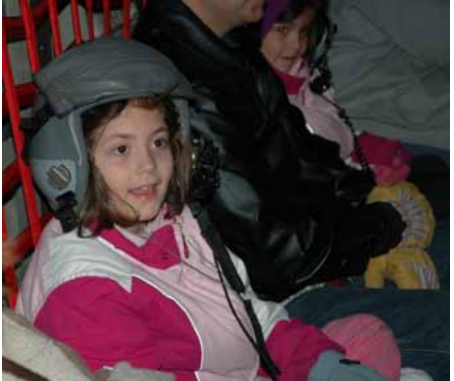
A young passenger gets the chance to be a

Visiting Santa and Mrs. Claus can be a memorable event for most children, usually occurring in a shopping mall. However, when you get to fly to the North Pole to visit the jolly old elf, the excitement can be almost unbearable for any kid. 'Operation Santa' occurred Saturday of the December UTA, when twenty-six fidgety, wide-eyed children from the