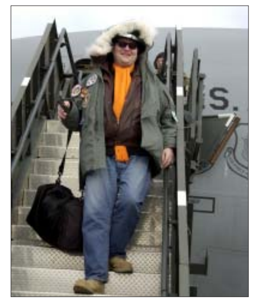
Traveler, walks off the KC-10 aircraft.