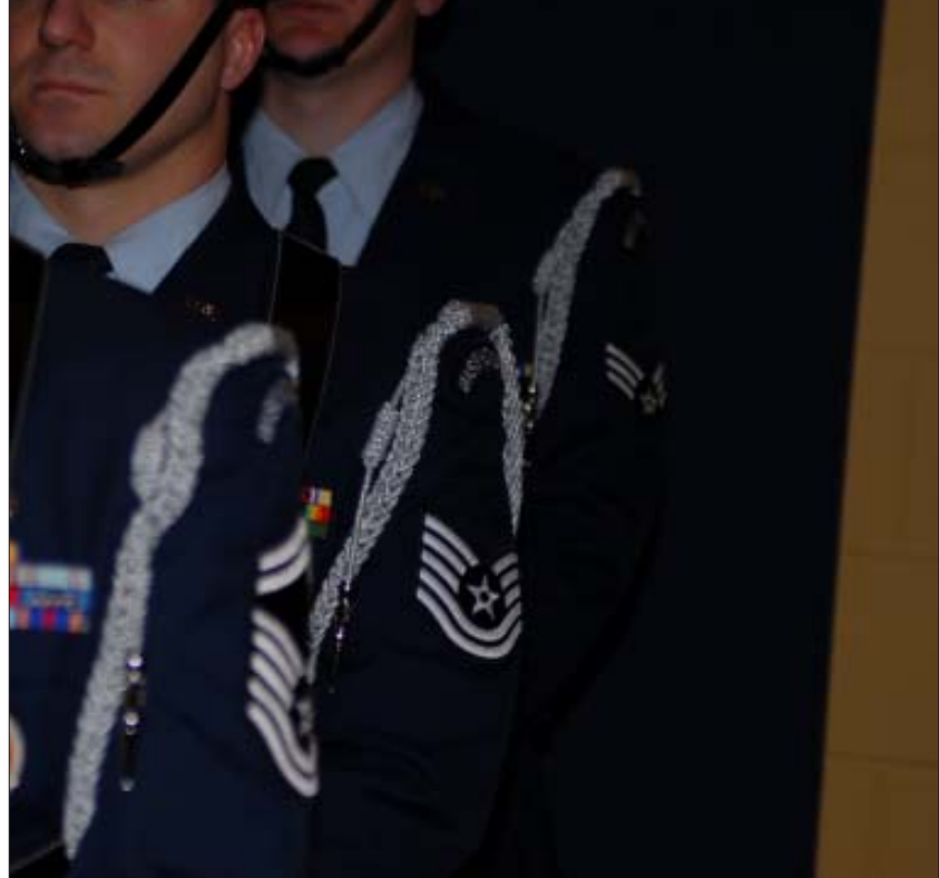
The honor guard prepares to post the colors at the ceremony.

"They won't change much after this because