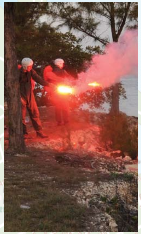
Flares illuminate the morning as training begins at the chute/vest station.

could get," the captain added. The Training Stations