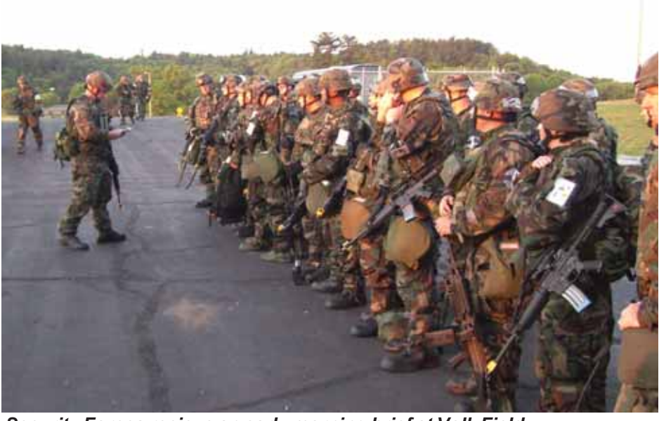
Security Forces recieve an early morning brief at Volk Field.

"ORTP4 helped us identify some of the things we need to work on before the ORE and ORI," said Colonel Tarchick. "We need to tighten up the initial response and redeployment phases, and refine the process of changing shifts in and out to make sure people from the first shift don't get stuck working into the second shift and vice versa. We also