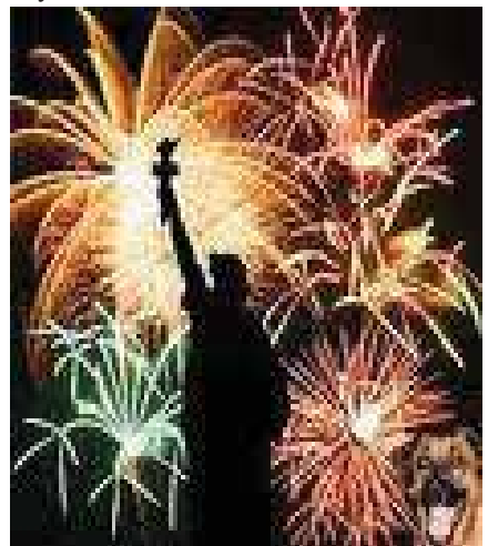
Have a safe and happy 4th of July Holiday!

To all our personnel, regardless if you have deployed to the AOR, supported the GWOT from the CONUS or helped prepare for the ORI, thanks for all you do. It takes teamwork, professionalism and a whole lot of dedication to be a Reservist these days.