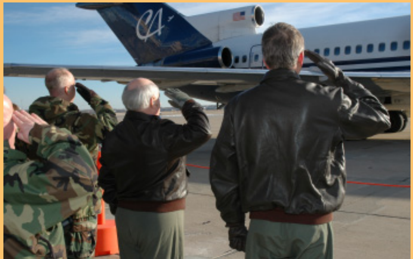
Wing members are saluted in respect for their service as their

During January and February Approximately 150 members of the Airlift Wing deployed or will deploy to Southwest Asia in support of Operation Iraqi Freedom. The all volunteer deployment is part of the Air Expeditionary Force cycle for the 934th which occurs every 20 months. During one of the January deployments Gov. Tim Pawlenty stopped by to show support for the troops and their families.