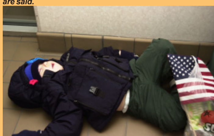
The long day of preparation and activity wears down a young family member.