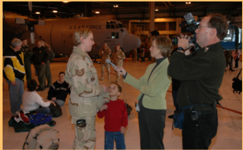
Local television stations talk with Reservists and family members.

During January and February Approximately 150 members of the Airlift Wing deployed or will deploy to Southwest Asia in support of Operation Iraqi Freedom. The all volunteer deployment is part of the Air Expeditionary Force cycle for the 934th which occurs every 20 months. During one of the January deployments Gov. Tim Pawlenty stopped by to show support for the troops and their families.