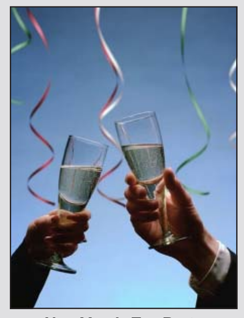
New Year's Eve Party Dec. 31 at the Officers' Club

Gov.Arm.com - Check out the many deals on leisure and vacation travel services for government and military members, including retirees.